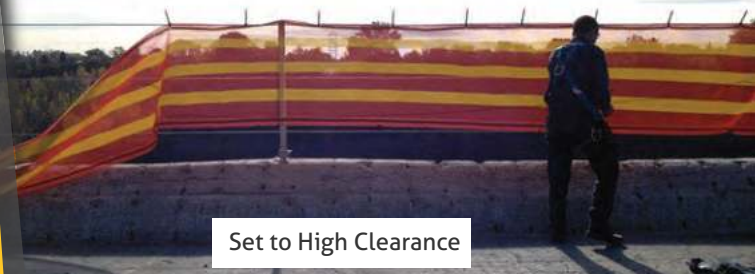
Set to High Clearance