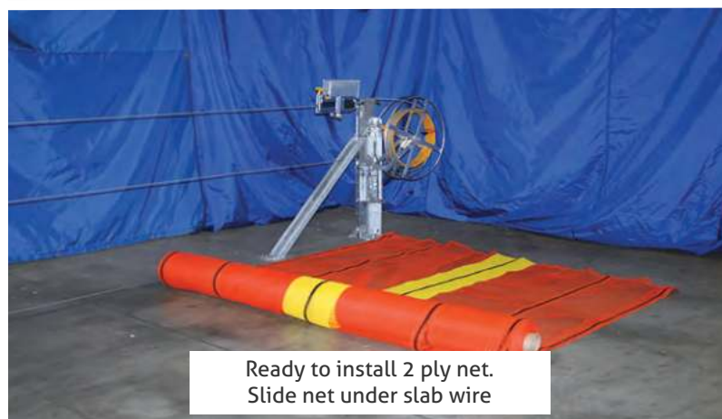
Ready to install 2 ply net. Slide net under slab wire