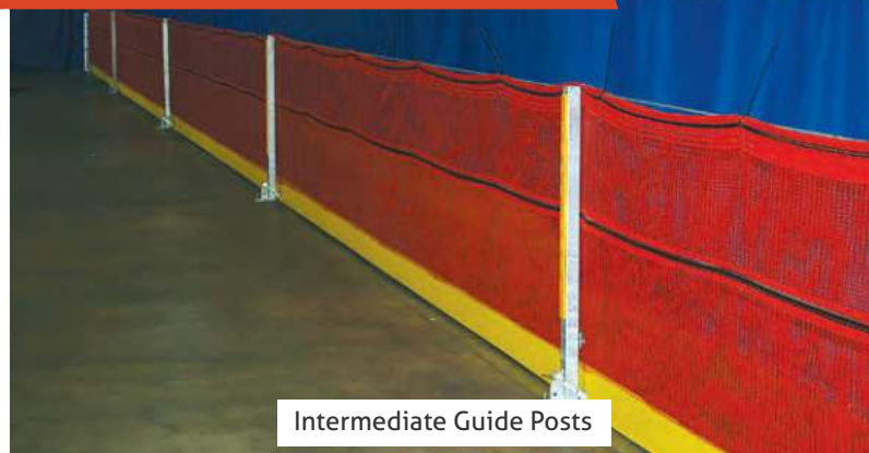
Intermediate Guide Posts