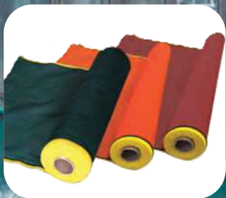
Green, Orange & Red Scafnet