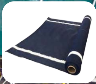
Navy Blue Tight Weave