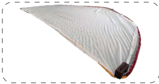
Scafnet® Panels with Hems & Grommets