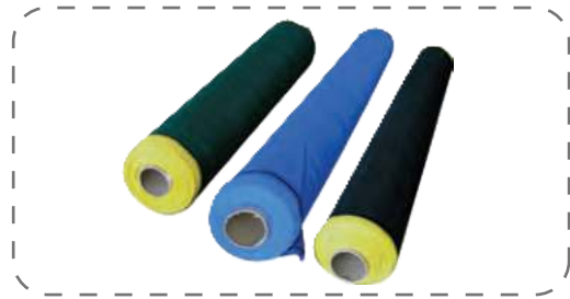
Bulk Roll Orders