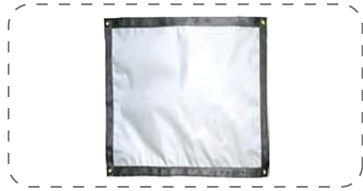
Vinyl Tarps with Hems & Grommets