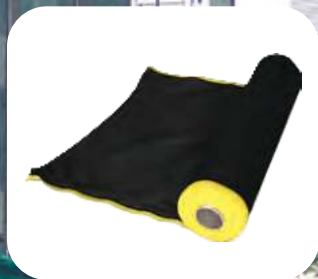
Black Tight Weave