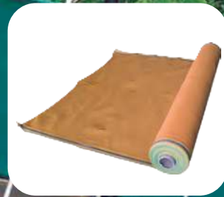
Barrier Rail Net