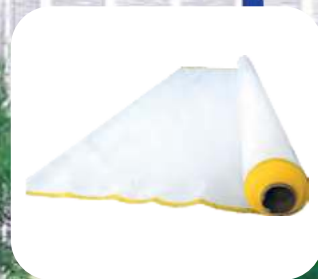
White High Strength